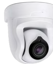
PAN/TILT/ZOOM CAMERA 87623