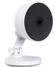
INDOOR CAMERA 87622