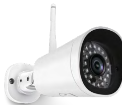
OUTDOOR CAMERA 87624

Our cameras are DIY-friendly to set up**. They integrate flawlessly into the B&D® eco system using B&D®'s own secure, trusted smart technology - not another 3rd party platform.